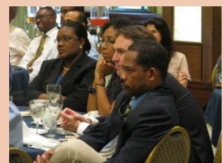
Everyone paid rapt attention